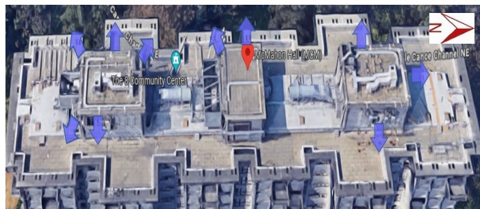
Figure 1: View from the roof.

Figure 1 shows an aerial view of the rooftop and platform where the antennas are located.