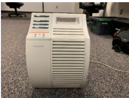
Typical portable air cleaner

Follow these steps to ensure the selection of the optimal portable air cleaner for your space: